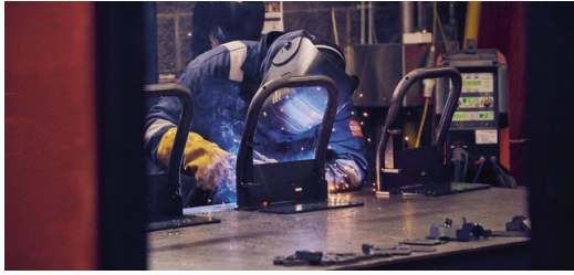
Hutchinson Engineering employs 100 people making products for customers from a variety of sectors ranging from bus manufacturers to the aviation industry.