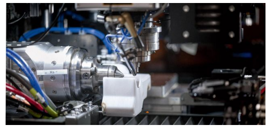
The principle of laser rotation: (to the left) the air-bearing rotational axis that holds the workpiece; the trepanning unit works from above. The workpiece rotates at a speed of 3,500 rotations per minute, where the focus circles are 30,000 times per minute.