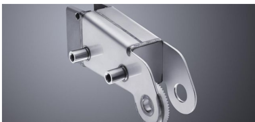
<p> TRUMPF Medizin Systeme setzt in der OP-Tisch-Fertigung auf die Pluspunkte vom Laserschweißen.</p>

This article was first published in May 2014.