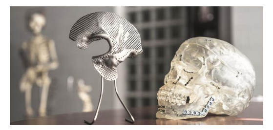
>What the eye can't see: the surfaces 3D printing can produce are the key to promoting a connection between the bone and the implant.