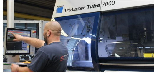
The finished program appears on the machine operator's terminal.