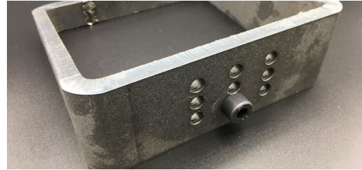
The TruLaser Tube 7000 can be used to fabricate a range of different threads in tubes.

Since the summer of 2017, the company's plant in the Swabian Jura region has been using a test unit of the TruLaser Tube 7000 laser tube cutting machine with integrated tapping system. "We are delighted to be working with TRUMPF on this kind of collaborative project, and we are certainly impressed with the new technology," says Frank Steinhart. The CO2 laser cuts tubes and profiles without leaving burrs and offers bevel cuts of up to 45 degrees, diameters up to 254 millimeters and wall thicknesses of between one and ten millimeters.