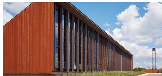
The building links the history of the "Rust Belt" as the oldest and largest industrial region in the USA with high-tech digitally connected production.