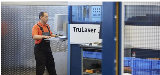
The PalletMaster Tower is programmed with the standard software of the machine and the operation is simple (Photo: Claus Langer).

In addition to speed, flexibility and process reliability, automated loading and removal of the material during the day also eases the operator's work and improves occupational safety. "Our nighttime operations are entirely unattended and, during the day shifts, the tower ensures that my crew no longer has to lug around the heavy and cumbersome large format sheets.