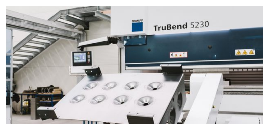
For boiler plate production, half-shell-shaped recesses must be made in the plate. First a hard nut for the TruBend Cell 5000. Today, the bending cell handles the forming process fully automatically, saving a lot of time.