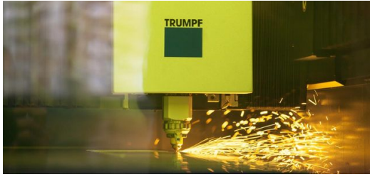
In March, FBT workers started using their new TruLaser 3030 to cut thin sheets and blanks to size.