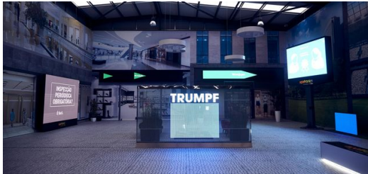
<p>Authentic: Cobblestones in the showroom help provide an authentic atmosphere.</p> – Frederik Dulay-Winkler