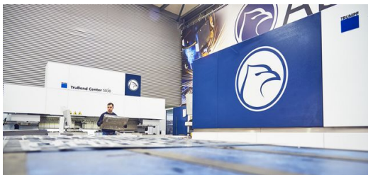
<p>Most up-to-date technologies: Worker with the TruBend Center 5030</p>