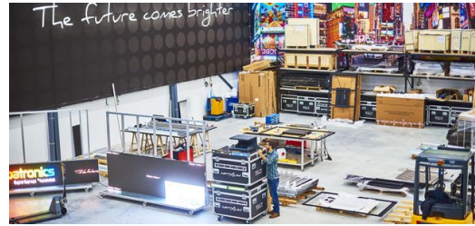
<p>Tailor-made: Apametal develops and builds each digital sign itself.</p> – Frederik Dulay-Winkler