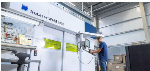
CoolCase uses the TruLaser Weld 5000 to solve three tricky welding tasks in the production of inverter housings.

Now comes the welding highlight: CoolCase attaches a heat sink to an opening on the housing roof. However, it is made of an aluminum alloy that is difficult to weld and also differs from the material of the rest of the component. "This alloy is particularly susceptible to hot cracking. That is exactly what must not happen with the housing under any circumstances." This is why the TruLaser Weld 5000 switches the welding method again and now uses a supplementary wire via FusionLine. "Finding the right parameters was a tightrope act here." He grins: "But I won't give away any details." In any case, the housing is now sealed and the electronics inside are safe from wind and weather.