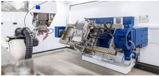
With the fast cycle time of the TruLaser Weld 5000's rotary table, CoolCase produces 100 housings a day.