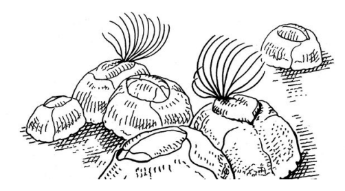
Barnacles (Balandiae) are arthropods that belong to the subphylum Crustacea. These sessile animals live primarily in coastal waters, though some species of barnacle live in deeper regions of the ocean. They use their feather-like appendages to fish for microorganisms and suspended particles.