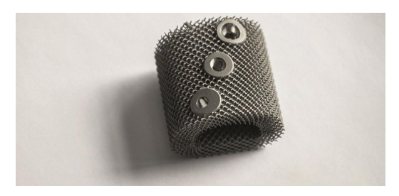
<pspan lang="EN-US">Prototype for 3D printed cages: for a long time, spinal fusion was the option of last resort for a herniated disc, but now 3D printed cages can restore vertebral segments to their natural height, allowing patients to return to pain-free mobility.

CONMET uses a Tru Print 1000 from TRUMPF to develop parameters and test different geometries and materials. "Our aim is to better understand all the processes involved," says Morozova. "That will enable us to produce custom-made, patient-specific implants and give us the groundwork we need to embark on full-scale production at the earliest possible stage." This is the second 3D printer from TRUMPF to be commissioned at CONMET. In early 2018, the company began using a TruPrint 1000 to make dental and craniomaxillofacial implants for cancer and traumatology patients. As well as the machine itself, TRUMPF also supplied the appropriate titanium powder, substrate plate, recoater tool and software. TRUMPF's high level of expertise and the overall success of the collaborative process were the deciding factors behind Dmitry Tetyukhin's decision to acquire the second printer. Morozova explains: "The TRUMPF experts in Ditzingen and their colleagues at the Moscow subsidiary offered us extensive support and advice to help us introduce the new technology and proved to be truly reliable partners. Their expertise played an invaluable role in the second project, too – for example when it came to determining the right parameters." CONMET plans to purchase a TruPrint 3000 to kick off full-scale production of its spinal implants.