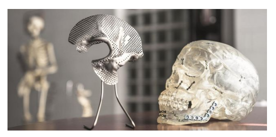
What the eye can't see: the surfaces 3D printing can produce are the key to promoting a connection between the bone and the implant.