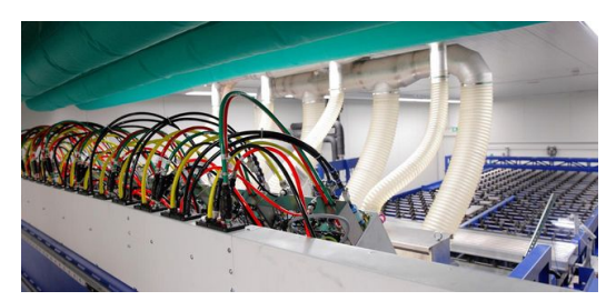
Laserlichtleitungen verbinden die Optiken mit den Lasern.