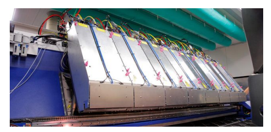
Die Boxen mit den Optiken sind in einer Brücke untergebracht, die die Förderstrecke überspannt.