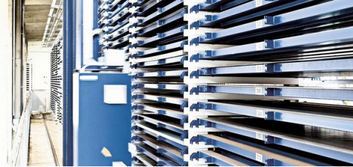
The modern high-bay storage system is based on the latest advanced technology and was the first step toward digital connectivity. Suitably integrated software interfaces are now being added in gradual stages.