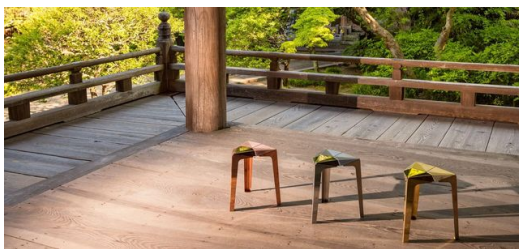
<p>The "Orisu" chair is something special: it makes abstract technologies visible to the viewer.</p>