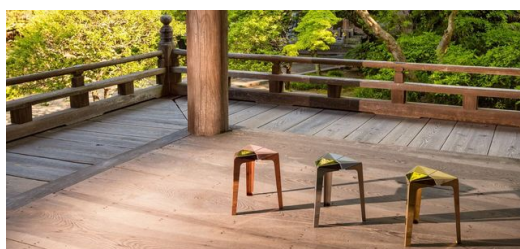
<p>The "Orisu" chair is something special: it makes abstract technologies visible to the viewer.</p>