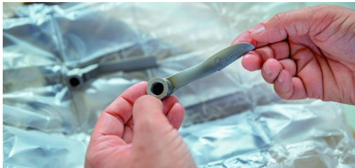
All one piece: Redesigned by Bionic Production, this nozzle offers gentle curves straight from the 3D printer.

The new nozzle is efficient in many different respects. The flow of coolant has been optimized, reducing pressure losses by up to 20 percent. That means you need a lower pressure - and less energy - to achieve the specified coolant exit velocity. The curved channels and optimized jet trajectory take the lubricoolant to the precise place it is needed, delivering no more and no less than is required to carry out the process in an optimum manner without causing thermal damage to the part. This reliable and automated solution for delivering lubricoolant eliminates factors that may have previously caused hold-ups in the manufacturing process.