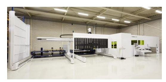
"Automating our machines eases the work for the employees. Instead of tedious and troublesome loading and unloading operations, they can devote their attention to other tasks during production operations," Sander Mutsaers explains.

"Even after this short period in use we have been able to reduce by 40 percent the time needed to manufacture the front panel of a pay-and-display machine, made of aluminum and stainless steel. The separate working phase at the press brake for small bendings is eliminated because the new punch laser cutting machine already takes care of the necessary bends," he tells us. Formed areas – like brackets, threads and hinges – are now made up quickly and easily on the TruMatic 6000 fiber. Four TRUMPF press brakes are used when processing larger parts and assemblies.