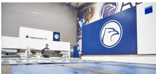
Most up-to-date technologies: Worker with the TruBend Center 5030