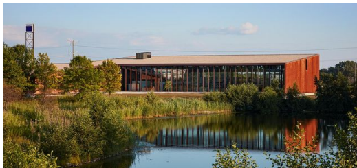
Chicago was consciously chosen as the location for the Smart Factory of TRUMPF. The directly adjacent states contain around 40 percent of the country's entire sheet metal working industry.

“Our customers in Chicago can witness a connected fleet of machines capable of processing orders automatically. The heart of the Smart Factory is a series of interconnected machines, many of which are linked to a STOPA high-bay warehouse. The entire production process is controlled by digital solutions that also always ensure transparency, e.g. with respect to order status or stocks of materials. In short, our Chicago facility provides customers with a live demonstration of the advantages of digitally connected manufacturing solutions, not to mention the future of sheet-metal processing.”