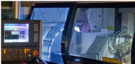
With the TruLaser Tube 7000 the tube specialists of ProfilLaseRichter have opportunities that many customers don't even know, yet. Examples are bending connections and also positioning aids with locating pins and cut-outs to simplify assembly. Thanks to the degree of automation in the machine the throughput times are shorter and so are the delivery times.

We have weld seam detection, which is certainly worthwhile when executing higher piece counts in automatic operation – and adaptive clamping devices so that we can machine open profiles. One major topic is minimizing slag spattering in circular profiles and we achieve this with the spatter guard protection. A LoadMaster makes sure that the loading process is reliable and it goes without saying that machining causes very little marring.