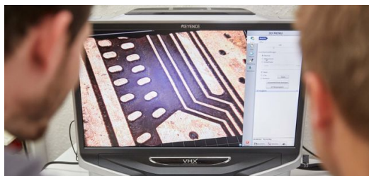
Part of the visual inspection involves documenting homogeneous ablation. The ablation zone is dark and shows the plastic surface. The key to successful machining is to ablate the gaps cleanly to provide electrical insulation between the conductive tracks.