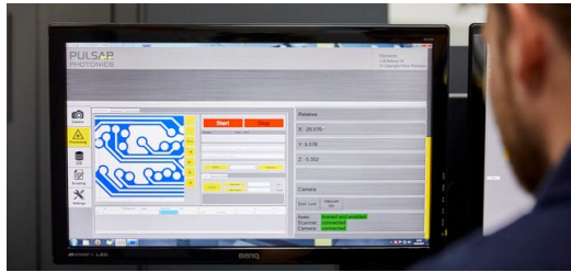
The Photonic Elements machine control software displays the ablation geometry executed during the process.

who specializes in each individual stage of component production, but we can't expect them to be an expert in every machine in the entire process."