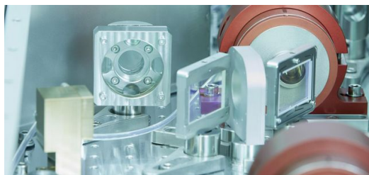
Optics for laser amplifier in science.

Ultimately there's one key thing that any potential entrepreneur needs to remember: if you're looking for an idea that amounts to more than just lines of code, you would be wise to take a careful look at what lasers can do. Or think carefully about what people who work with lasers need. Or at least mull over what lasers can do to help people who are planning something new – or who are simply looking to save the world.