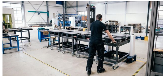
Sensors at the docking station detect when a pallet or pallet cage is parked and report this directly to TRUMPF's TruTops Fab software, which then takes over the automatic transport control.