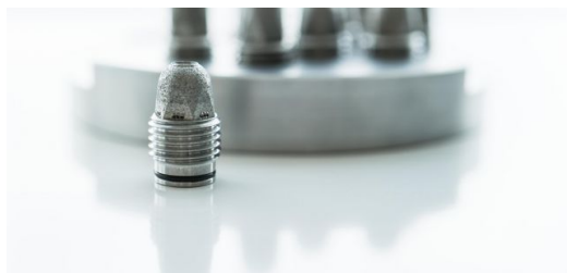
3D-optimized sewer cleaning system: This 3D-printed nozzle for sewer cleaning systems was optimized by TRUMPF.

TRUMPF experts set up a test bed to examine and validate the 3D-printed components. "Measurements have shown that this shortens the job time for conventional steps by 53 percent," says a clearly delighted Arikcan. The parts were made with the TruPrint 1000 3D printer; developed by TRUMPF, it features a single laser. This expert is confident that the time savings will be even greater with a multi-laser system. The new nozzles also deliver more persuasive performance with benefit of improved jet guidance. "We demonstrated that the water jet flows smoother than with the conventional design. We also expect the pressure on the surface to increase and water consumption to decrease," says Arikcan. Another positive side effect is that this boosts turning and milling stations' availability.