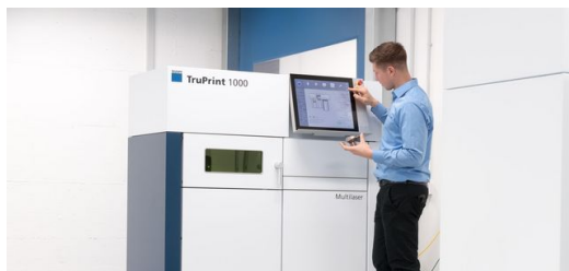
TruPrint 1000: TRUMPF's TruPrint 1000 3D printer