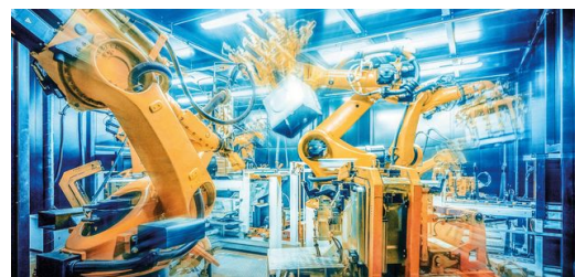
In manufacturing Industry 4.0 will lead to an unprecedented push for flexibility. Optical sensors and measurement devices will provide the data needed.