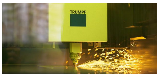
In March, FBT workers started using their new TruLaser 3030 to cut thin sheets and blanks to size.