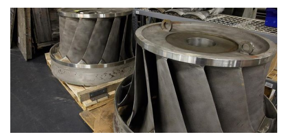
Laser-cladded turbines: "Does it work?" is a question Dan Hayden often hears.

Cylinders and wearing surfaces are pretty common geometries for us, but we work on a broad range of applications. We've cladded some very large parts – blades for hydroelectric turbines 1.5 meters in diameter, for example – but also small parts measuring just 1.5 centimeters.