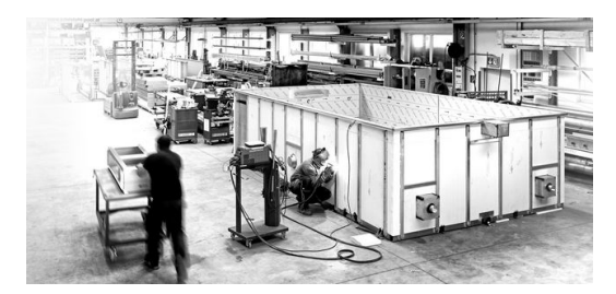
In one piece: Pools with standard dimensions are fully finished at Gassner and transported to the installation site on flatbed trucks.