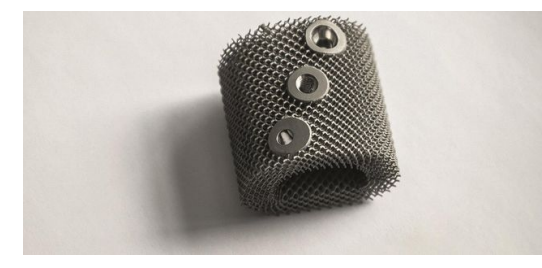
Prototype for 3D printed cages: for a long time, spinal fusion was the option of last resort for a herniated disc, but now 3D printed cages can restore vertebral segments to their natural height, allowing patients to return to pain-free mobility.

CONMET uses a Tru Print 1000 from TRUMPF to develop parameters and test different geometries and materials. "Our aim is to better understand all the processes involved," says Morozova. "That will enable us to produce custom-made, patient-specific implants and give us the groundwork we need to embark on full-scale production at the earliest possible stage." This is the second 3D printer from TRUMPF to be commissioned at CONMET. In early 2018, the company began using a TruPrint 1000 to make dental and craniomaxillofacial implants for cancer and traumatology patients. As well as the machine itself, TRUMPF also supplied the appropriate titanium powder, substrate plate, recoater tool and software. TRUMPF's high level of expertise and the overall success of the collaborative process were the deciding factors behind Dmitry Tetyukhin's decision to acquire the second printer. Morozova explains: "The TRUMPF experts in Ditzingen and their colleagues at the Moscow subsidiary offered us extensive support and advice to help us introduce the new technology and proved to be truly reliable partners. Their expertise played an invaluable role in the second project, too – for example when it came to determining the right parameters." CONMET plans to purchase a TruPrint 3000 to kick off full-scale production of its spinal implants.