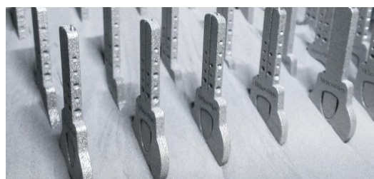
The 3D printing process enabled the young engineers to completely