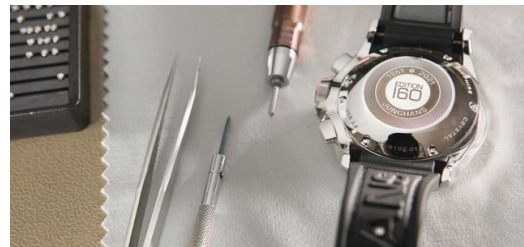
"A watch is simply not finished without the engraving," explains Matthias Stotz. The anniversary engraving is unmistakable with its fine structures, clean lettering and individual limitation number.