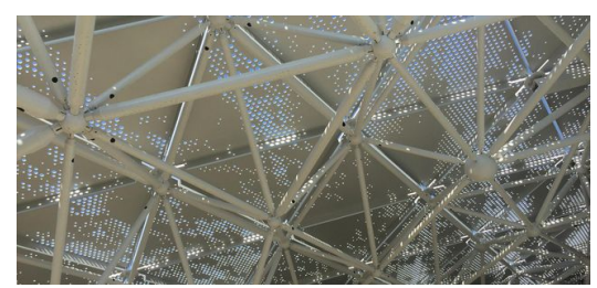
For the SoFi, A. Zahner used three TRUMPF machines to cut and punch 37,000 different panels with around 30 million irregularly distributed holes.