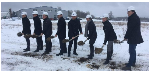
The ground-breaking ceremony for the new production hall at the TRUMPF site in Hettingen in January 2019. 120 employees are to move into the competence center in two years.