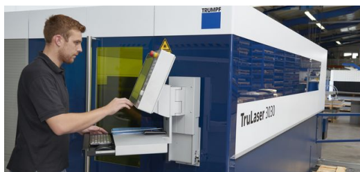
Christoph Sigel is particularly impressed by the Drop&Cut function, an unrivaled solution for quick post-production.

In spite of the fact that another machine tool manufacturer was close by, the Sigels traveled to the TRUMPF show room in Ditzingen. The quality of the specimen parts was just as convincing as the rugged engineering of the TruLaser 3030 fiber. "The machine is really made for shop use. Every detail has been thought out entirely," acknowledges Christoph Sigel. "I was particularly impressed by the Drop&Cut function, an unrivaled solution for quick post-production." Drop&Cut uses a camera to transmit a live picture of the machine's interior right to the display at the control terminal. A mouse click or touching the screen is sufficient to project the geometry of the desired part onto the remaining plate. Parts can be positioned and turned, inside the camera's field of view, on the sheet metal. Here outlines can be rotated, shifted, copied or deleted as desired. Christoph Sigel: "Post-production couldn't be any easier."