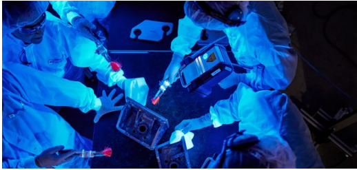
Most of the system is disassembled and cleaned in order to remove any microscopically small particles before being dispatched. Such contamination could prevent the laser from operating correctly at the customer's site.