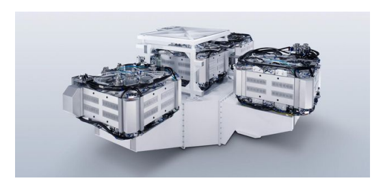
Since the beginning of 2014 TRUMPF has delivered its third-generation laser systems to ASML in Netherlands, the only manufacturer of EUV photolithography systems in the world.

Secondly, it is only the wavelength of 13.5 nanometers that makes it possible to manufacture the layer systems required for optical imaging at sufficiently high reflectivity. Refractive optical elements – such as lenses – absorb this wavelength. That is why EUV systems work exclusively with mirrored optical elements. The very short wavelength is also the reason why the entire process has to take place in a vacuum, since air would also absorb the EUV radiation.