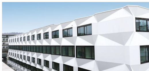
As painted: The facade of the University of Lucerne comes from BIGSTEEL.