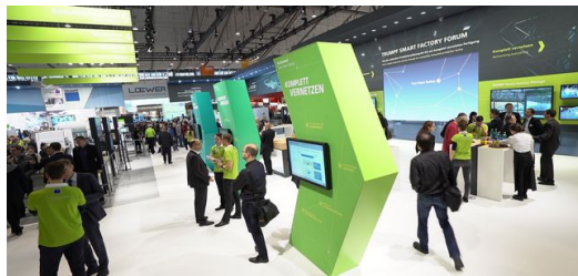
Thanks to the green T-shirts of the TruConnect consultants, visitors who had questions about the TRUMPF solutions for the Smart Factory quickly found what they were looking for.