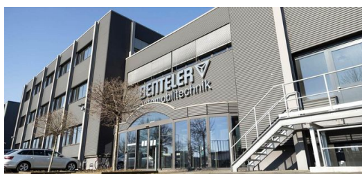
<p>BENTELER is a fourth-generation family business, with headquarters in Paderborn, Germany. In its Automotive Division, this metal process specialist develops, produces and sells safety-relevant products, systems and services for the automotive industry.</p>