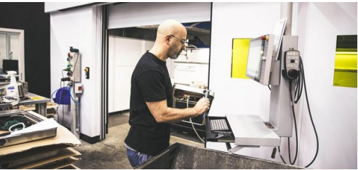
Rieber is a leading supplier of kitchen technology for restaurants and private households. But the company from Reutlingen also produces components and assemblies made of stainless steel and titanium for the aerospace industry. Quality is particularly important here.