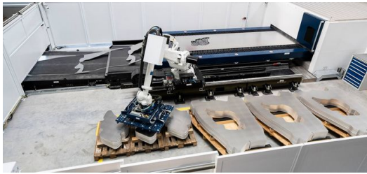
Laser blanking: A robot automatically sorts the cut components.