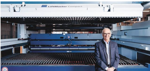
LiftMaster Compact Part Master