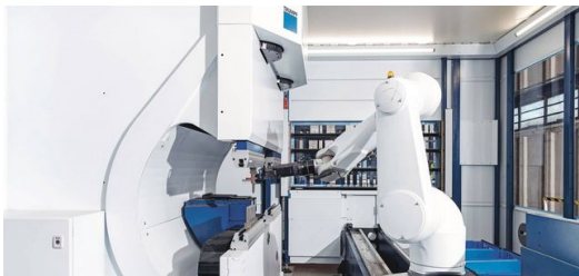
TruBend Cell 7000

Jordão Jordão 1982 22 250 10 Jordão 2150