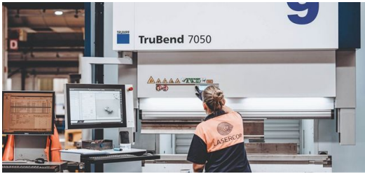
Lasercon: TRUMPF: 8000