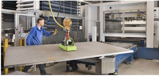
<p> 3 50 </p>