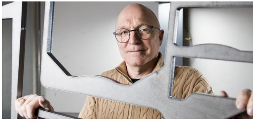
<p> Krämer Brennteile </p>