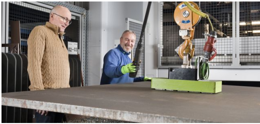
<p> 3 </p>