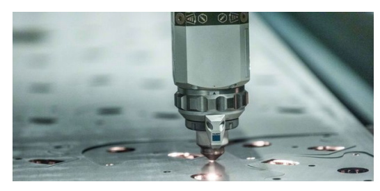
When cutting stainless steel in the thickness range of three to 20 millimeters, DELO needs up to 70 percent less nitrogen with the HighSpeed Fco option.