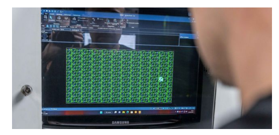
The CoolLine option guarantees consistent temperatures during laser cutting. "This means that we can nest parts much more closely and save material," Denis Lozusic is pleased.