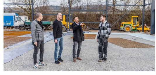
DELO is planning on relocating to neighboring Hechingen in September 2023. Construction work is in full swing. With a developed area of 2,000