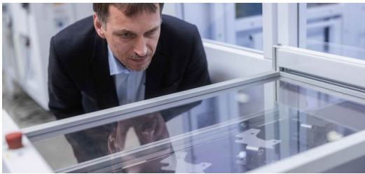
Steinhuber TruBend 7050 TRUMPF Flex Cell 2