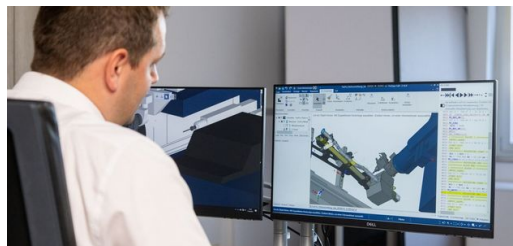
<p class="MAGAFlietext"> TecPro