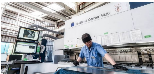
<p>An employee working with the <a href="https://www.trumpf.com/en_INT/products/machines-systems/bending-machines/trubend-center-series-5000/">TruBend Center 5030</a>. This is how the "Orisu" chair is made.</p>

KANEYOSHI manufactures Ishida's design with TRUMPF machines. This offers advantages: "On TRUMPF machines, I can use different manufacturing processes within a short time. This allows me to finish the product faster," Yoshida explains. The production of the chair shows what the KANEYOSHI company is capable of: First, lasers cut uniform components from sheet metal. When bent in the right places and welded together, these components finally make up the finished object like puzzle pieces. The designer and Yoshida choose the material quite deliberately: "Unlike wooden products, sheet metal has the advantage that its strength can be increased simply by bending it. So we don't need any additional components to assemble the chair. This saves material and weight," explains Ishida.