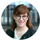
CATHARINA DAUM TRUMPF

4 x TruLaser 5030 fiber, 4 x TruLaser 5030, TruLaser 5040, TruMatic 6000, TruMatic 7000, 3 x TruLaser Cell 7040, TruLaser Cell 3008, 2 x TruLaser Tube 7000, 2 x TruLaser Robot 5020 and others