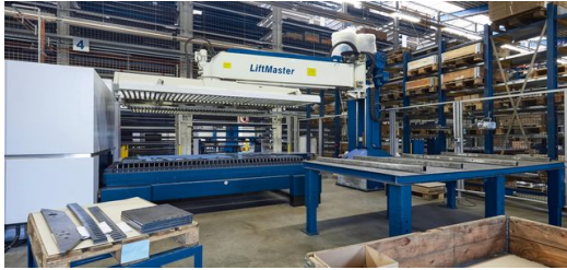
A Stopa storage system takes care of supplying materials while a LiftMaster makes it easier to handle parts.